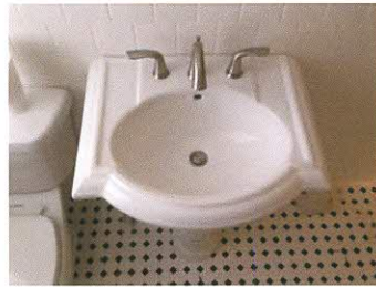
New fixtures in all bathrooms