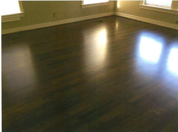
One of three large downstairs bedrooms