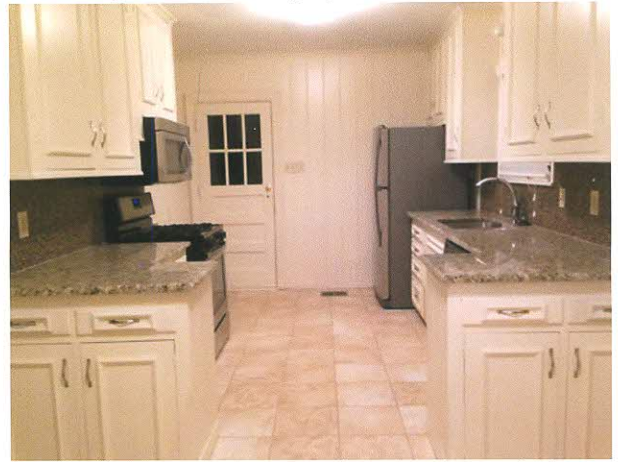
New kitchen has granite and stainless