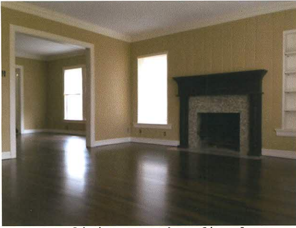
Large living room has fireplace