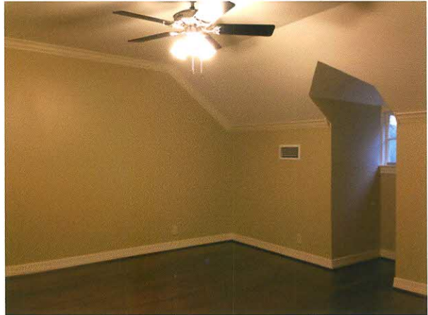
Upstairs bedroom #1