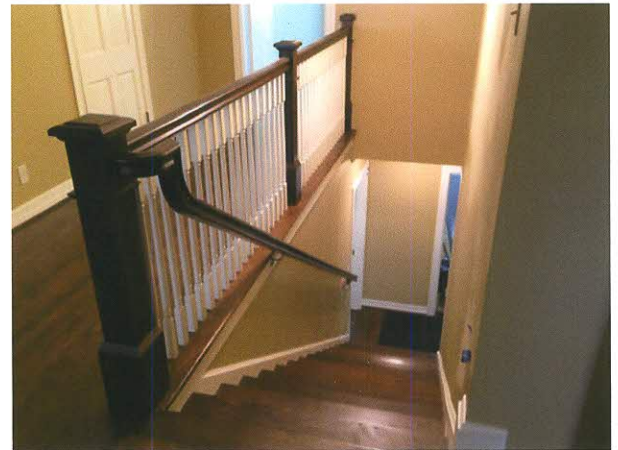
Beautiful staircase to 4th and 5th bedrooms and upstairs living area